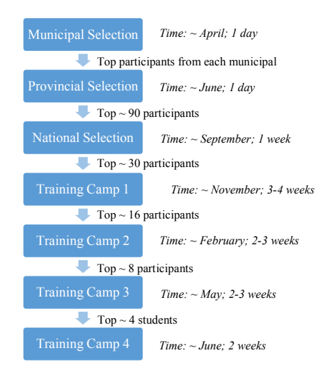
Fig. 4. Selection processes.

The test in municipal and provincial levels are conducted in their own locations, and only at the national level is it conducted centrally in the same location at the same time.