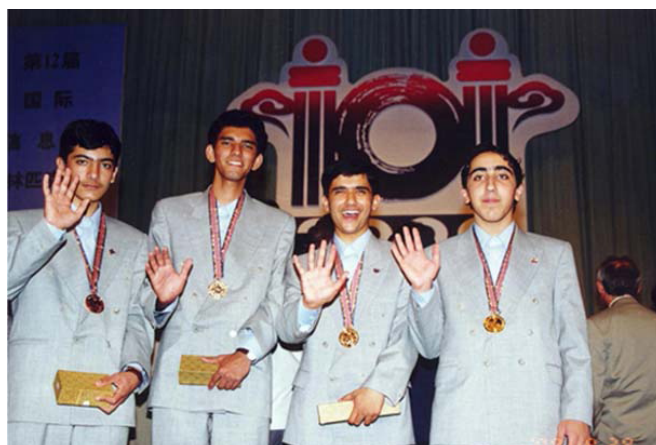
Fig.3. Team of Iran students in IOI'2000 Beijing, China.

members, our rank in IOI'1993 was 4 th , which was our best such ranking until 2016, that we obtained two gold medals and two silvers and ranked 3rd.