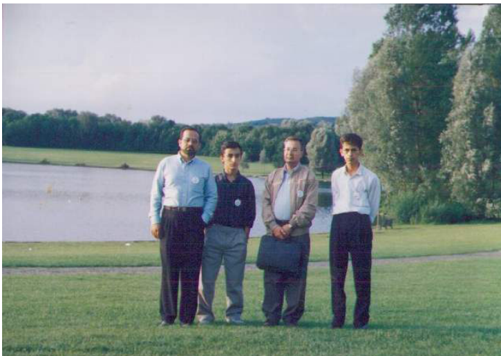
Fig. 1. IOI'1992, Bonn, Germany.

Next year in 1993, I was the team leader in IOI'1993 in Mendoza, Argentina (Fig. 2). Our team obtained one gold (full mark), one silver, and two bronze medals. If we unofficially rank the participating teams based on the sum of the scores of the team