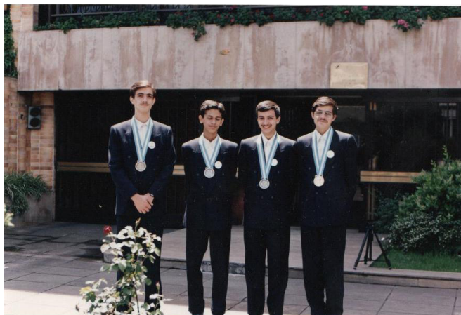
Fig. 2. Team of Iran students in IOI'1993, Mendoza, Argentina.